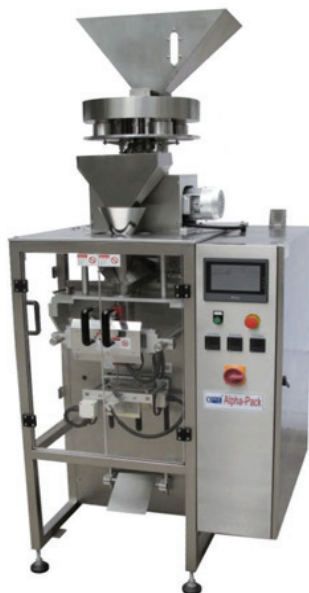
PM-320BE + VCF-500 with Volumetric cup filler