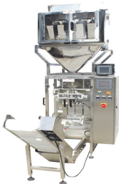
PM-320BE + MHW-04 with Linear Weigher

Automatic packaging of liquid, powder and granule in formed pouch for the food, pharmaceutical, chemical, and other industries.